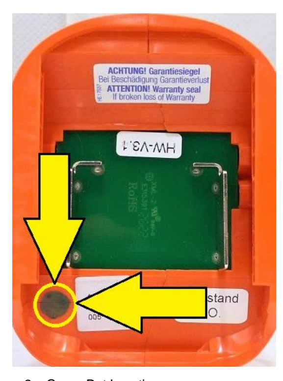
Figure 2 – Green Dot Location

STEP 2 – look for the presence of a Green Dot in the corner next to the serial number label (figure 2)